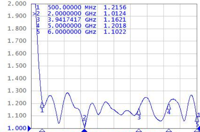
Tr1 S11 SWR 100.0m/ Ref 1.000 [F2]