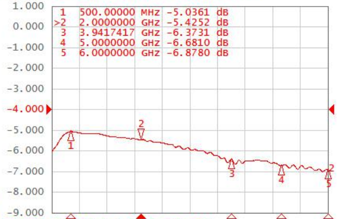
Tr2 S21 Log Mag 1.000dB/ Ref -4.000dB [F2]